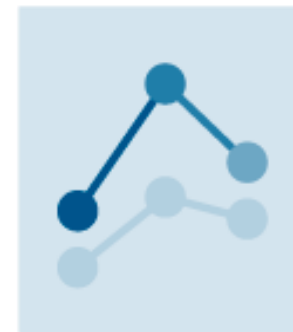
Climate Change Data